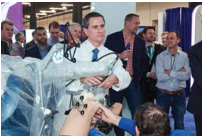
Exhibit space will be assigned on a first-come, first-served basis upon receipt of exhibit applications and full payment to AAHKS. Visit www.AAHKS.org/Meeting to select, apply for and purchase booth space. The subletting of space is not permitted.