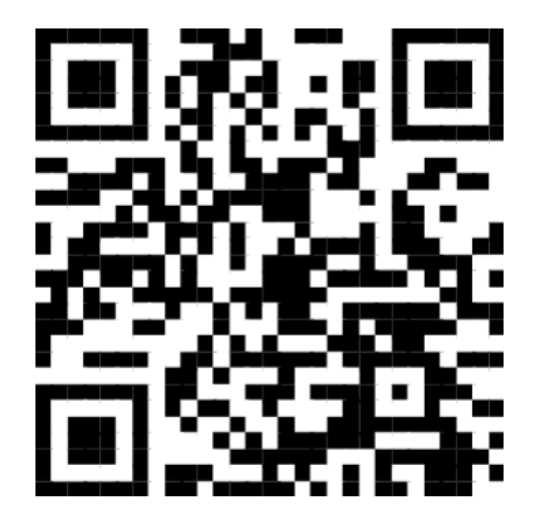
Scan to download the 2021 AAHKS Mobile App!