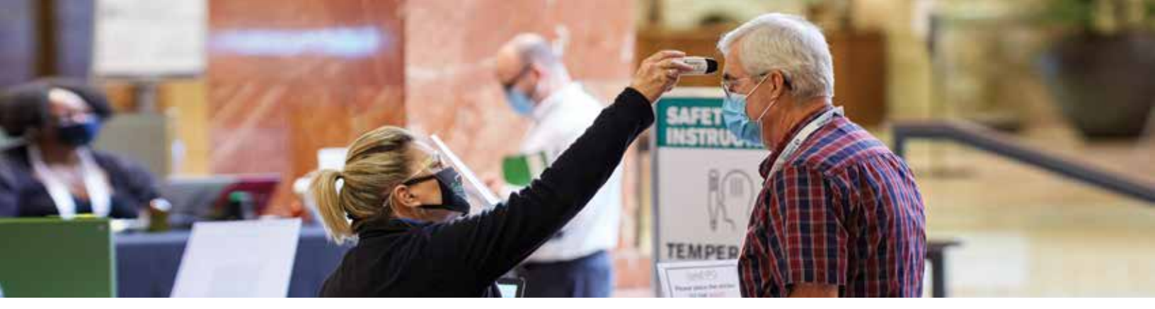
Policy Forecast continues...

of current models and plans before announcing any new policy directions. Prescription drug pricing may be a new focus of CMMI along with ongoing work on episode bundles, post-acute care, and primary care. We do know that at some point in 2021, CMMI must finalize the standards for and accept applications for year six of the CJR model.